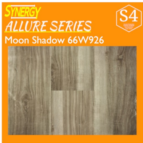
MOON SHADOW 66W926