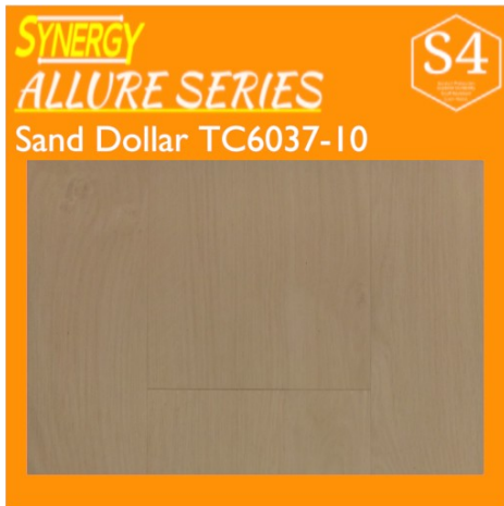
SAND DOLLAR TC6037-10