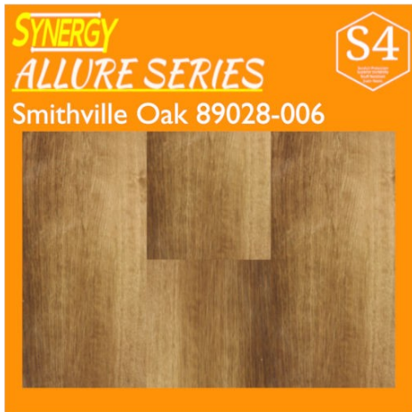
SMITHVILLE OAK 89028-006