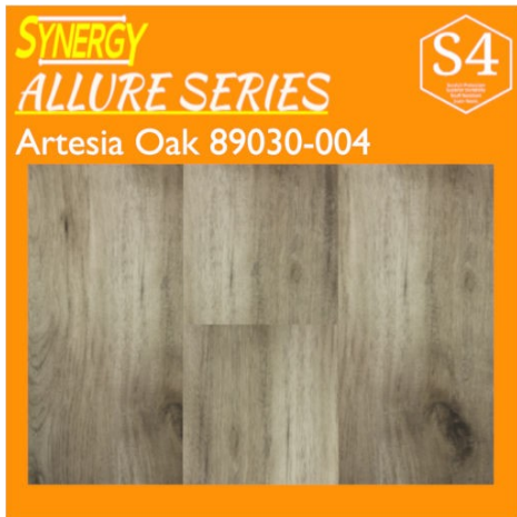
ARTESIA OAK 89030-004