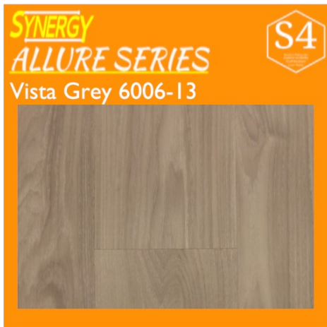
VISTA GREY 6006-13